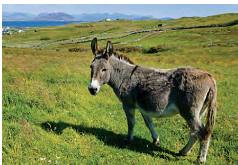
Figure 9.2 Mule

Controlled breeding experiments are carried out using artificial insemination . The semen is collected from the male that is chosen as a parent and injected into the reproductive tract of the selected female by the breeder. The semen may be used immediately or can be frozen and used at a later date. It can also be transported in a frozen form to where the female is housed. In this way desirable matings are carried. Artificial insemination helps us overcome several problems of normal matings. Can you discuss and list some of them?