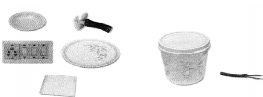
Articles made of thermosetting plastics