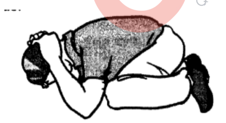
Protection of head and neck during tornado in bent position