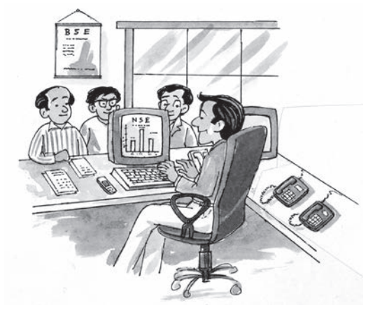
Electronic Trading System

Every broker has to have access to a computer terminal that is connected to the main stock exchange. In this screen-based trading, a member logs on to the site and any information about the shares (company, member, etc.) he wishes to buy or sell and the price is fed into the computer. The software is so designed that the transaction will be executed when a matching order is found from a counter party. The whole transaction is carried on the computer screen with both the parties being able to see the prices of all shares going up and down at all times during the time that business is transacted and during