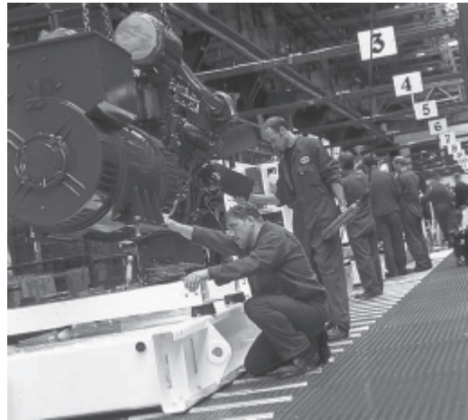
Fig. 5.3 Scientific and technical manpower: a rich ingredient of human capital

Empirical evidence to prove that increase in human capital causes economic growth is rather nebulous. This may be because of measurement problems. For example, education measured in terms of years of schooling, teacher-pupil ratio and enrolment rates may not reflect the quality of education; health services measured in monetary terms, life expectancy and mortality rates may not reflect the true health status of the people in a country. Using the indicators mentioned above, an analysis of improvement in education and health sectors and growth in real per capita income in both developing and developed countries shows that there is convergence in the measures of human capital but no sign of convergence of per capita real income. In other words, the human capital growth in developing countries has been faster but the growth of per capita real income has not been that fast. There are reasons to believe that the