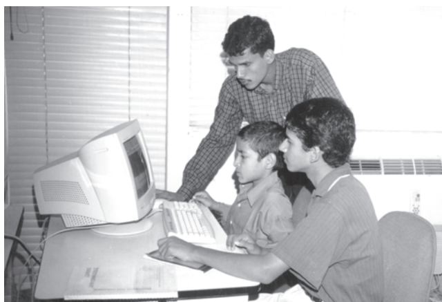
Fig. 5.4 Job on hand: transforming India into a knowledge economy

across the country. Are we ready to take our place besides the USA and China as the top three largest economies of the world and be confident of sustaining it in the following years? To do this, we will need a knowledge society based on a robust education system, with all the requisite attributes and characteristics in the context of changes in knowledge demands, technologies, and the way in which society lives