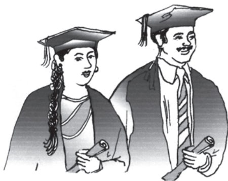
Fig. 5.7 Higher Education: few takers

unemployment among educated youth is the highest. As per NSSO data, in the year 2011-12, the rate of unemployment among youth males who studied graduation and above in rural areas was 19 per cent. Their urban counterparts had relatively less level of unemployment at 16 per cent. The most severely affected ones were young rural female graduates as nearly 30 per cent of them are unemployed. In contrast to this, only about 3-6 per cent of primary level educated youth in rural and urban areas were unemployed. The situation is yet to improve as indicated by the Periodic Labour Force Survey 2017-18. Therefore, the government should increase allocation for higher education and also improve the standard of higher education institutions, so that students are imparted employable skills in such institutions. When compared to less educated, a large proportion of educated persons are unemployed. Why?