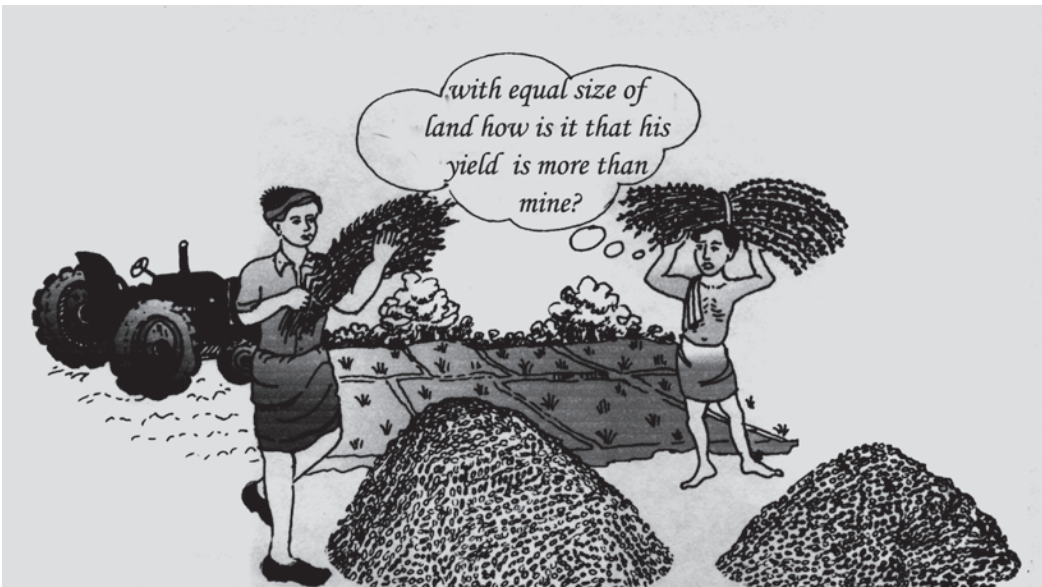
Fig. 5.1 Adequate education and training to farmers can raise productivity in farms

Education is sought not only as it confers higher earning capacity on people but also for its other highly valued benefits: it gives one a better social standing and pride; it enables one to make better choices in life; it provides knowledge to understand the changes taking place in society; it also stimulates innovations. Moreover, the availability of educated labour force facilitates adaptation of new