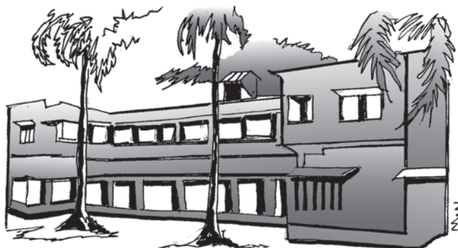
Fig. 5.5 Investment in educational infrastructure is inevitable

One can understand the inadequacy of the expenditure on education if we compare it with the desired level of education expenditure as recommended by the various commissions. About 55 years ago, the Education Commission (1964–66) had recommended that at least 6 per cent of GDP be spent on education so as to make a noticeable rate of growth in educational achievements. The Tapas Majumdar Committee, appointed by the Government of India in 1999, estimated an expenditure of around Rs