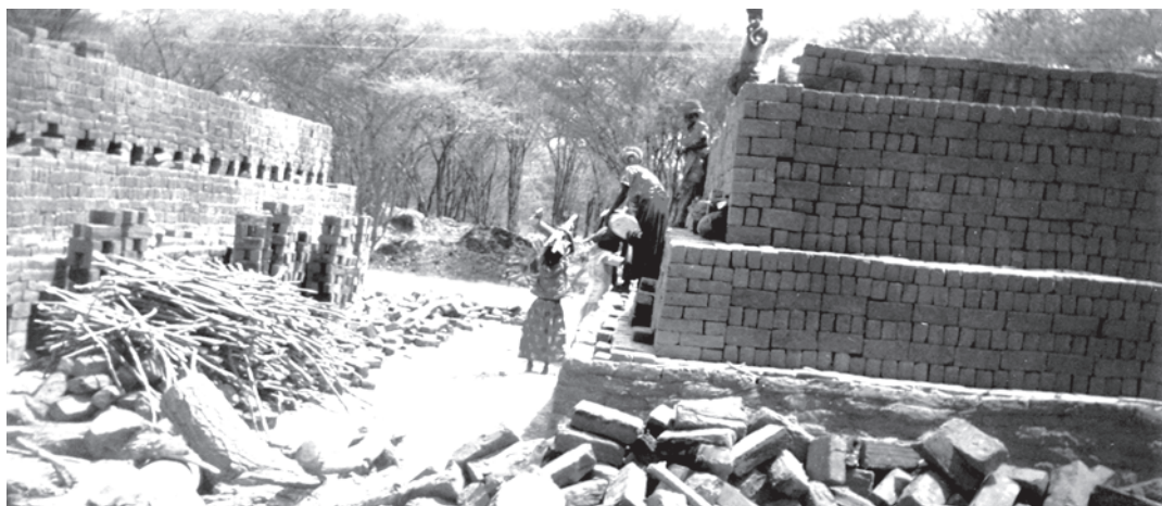
Fig. 5.6 School dropouts give way to child labour: a loss to human capital

Though literacy rates for both — adults as well as youth — have increased, still the absolute number of illiterates in India is as much as India’s population was at the time of independence. In 1950, when the Constitution of India was passed by the Constituent Assembly, it was noted in the Directive Principles of the