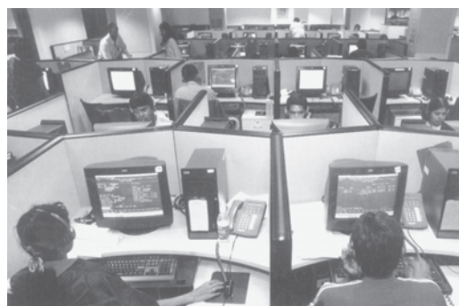
Fig. 3.2 IT industry is seen as a major contributor to India's exports

Indian economy during this period. In economics, the growth of an economy is measured by the Gross Domestic Product. Look at Table 3.1. The post-1991 India witnessed a rapid growth in GDP on a continual basis for two decades. The growth of GDP increased from 5.6 per cent during 1980-91 to 8.2 per cent during 2007-12. During the reform period, the growth of agriculture has declined. While the industrial sector reported fluctuation, the growth of the service sector has gone up. This indicates that this growth is mainly driven by growth in the service sector. During 2012-15, there has been a setback in the growth rates of different sectors witnessed post-1991. While agriculture recorded a high growth rate during 2013-14, this sector witnessed negative growth in the subsequent year. While the service sector continued to witness a high level of growth — higher than the overall GDP growth in 2014-15, this sector witnessed the high growth rate of 9.8 per cent. The industrial sector witnessed a step decline during 2012-13, in the subsequent years it began to show a continuous positive growth.