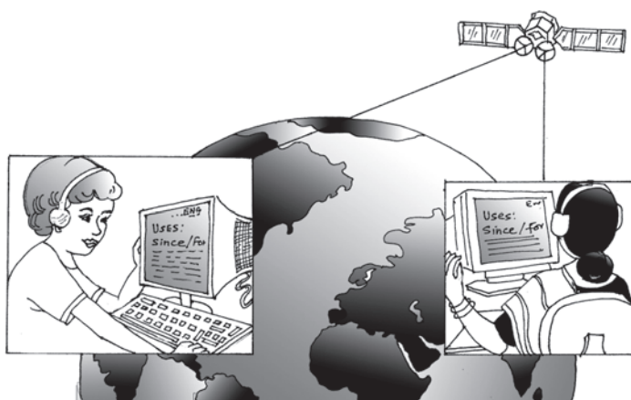
Fig. 3.1 Outsourcing: a new employment opportunity in big cities

global trade organisation to administer all multilateral trade agreements by providing equal opportunities to all countries in the international market for trading purposes. WTO is expected to establish a rule-based trading regime in which nations cannot place arbitrary restrictions on trade. In addition, its purpose is also to enlarge