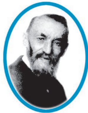
G. Peano (1858-1932)

In contrast to deduction, inductive reasoning depends on working with each case, and developing a conjecture by observing incidences till we have observed each and every case. It is frequently used in mathematics and is a key aspect of scientific reasoning, where collecting and analysing data is the norm. Thus, in simple language, we can say the word induction means the generalisation from particular cases or facts.