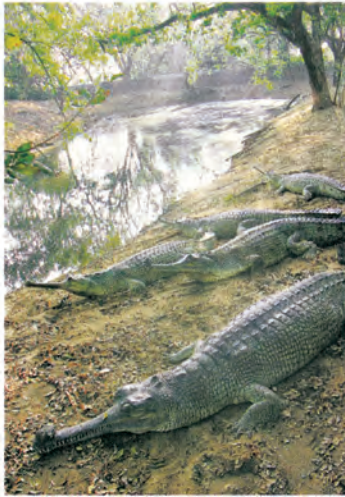
CRITICALLY ENDANGERED: Captive gharial at the Madras C

W ISPY tendrils of mist rise delicately from the water surface, tinged gold by the dawn. Your breath hangs as little clouds of vapour as you gaze upon the Girwa River on a cold winter morning. A trio of hollow clapping sounds from the other side of the river, half a kilometre away tells you that an adult male gharial is advertising his presence. It is the height of the breeding season. The place seems trapped in a time in early history when man was still clad in animal skins. It is only as the sun rises higher and burns the mist off the water that the world comes into focus with appalling clarity. The five-km stretch of the Girwa River in Katerniaghat Wildlife Sanctuary is one of the only three wild breeding sites left in the world for the most unique of all the