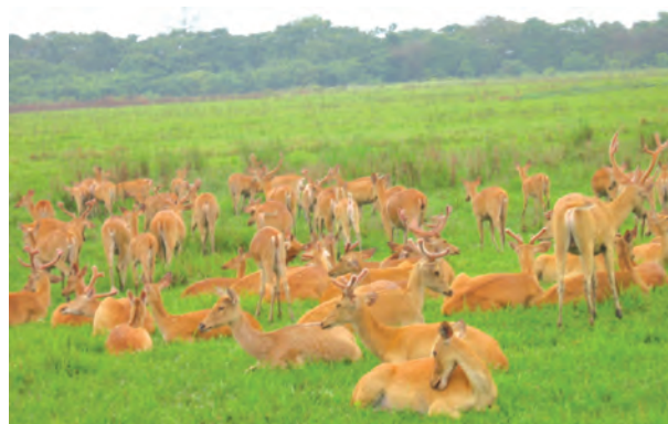
Fig. 2.4: Rhino and deer in Kaziranga National Park

dwindled to 1,827 from an estimated 55,000 at the turn of the century. The major threats to tiger population are numerous, such as poaching for trade, shrinking habitat, depletion of prey base species, growing human population, etc. The trade of tiger skins and the use of their bones in traditional medicines, especially in the Asian countries left the tiger population on the verge of extinction. Since India and Nepal provide habitat to about two-thirds of the surviving tiger population in the world, these two nations became prime targets for poaching and illegal trading.