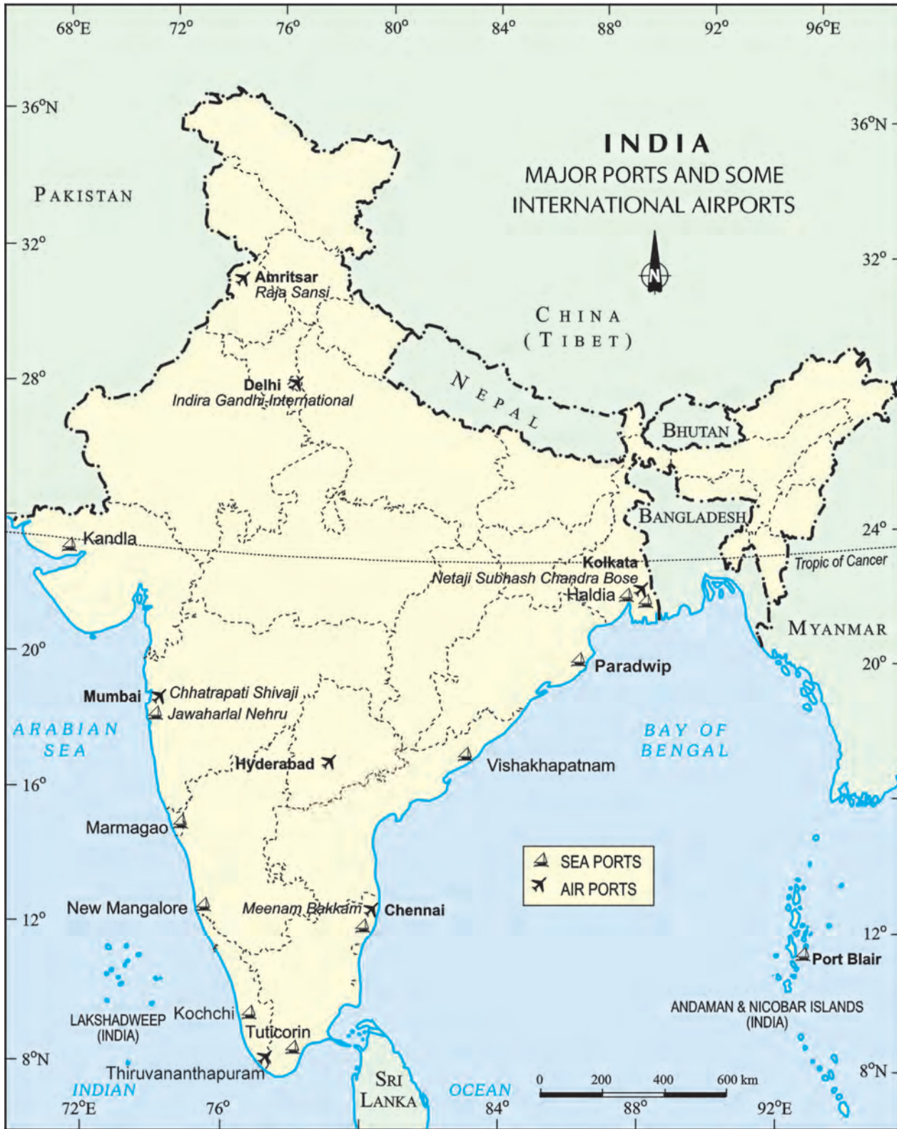
India: Major Ports and Some International Airports