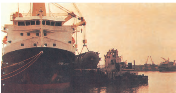
Fig. 7.8: Handling of oversize cargo at Tuticorin port

even our neighbouring countries like Sri Lanka, Maldives, etc. and the coastal regions of India. Chennai is one of the oldest artificial ports of the country. It is ranked next to Mumbai in terms of the volume of trade and cargo. Vishakhapatnam is the deepest landlocked and well-protected port. This port was, originally, conceived as an outlet for iron ore exports. Paradwip port located in Odisha, specialises in the export of iron ore. Kolkata is an inland riverine port. This port serves a very large and rich hinterland of Ganga-Brahmaputra basin. Being a tidal port, it requires constant dredging of Hoogly. Haldia port was developed as a subsidiary port, in order to relieve growing pressure on the Kolkata port.