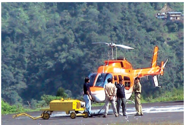
Why is air travel preferred in the north-eastern states?

The air travel, today, is the fastest, most comfortable and prestigious mode of transport. It can cover very difficult terrains