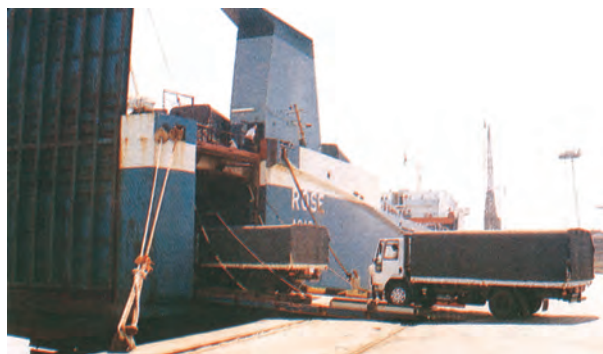
Fig. 7.6: Trucks being driven into the vessel at Mumbai port

Deendayal Port, is a tidal port. It caters to the convenient handling of exports and imports of highly productive granary and industrial belt stretching across the states of Jammu and Kashmir, Himachal Pradesh, Punjab, Haryana, Rajasthan and Gujarat.