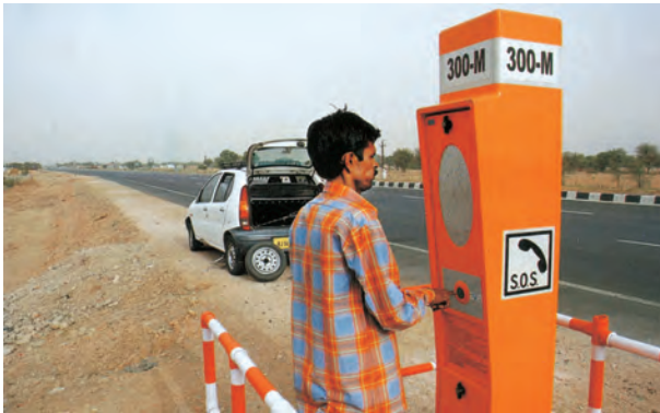
Fig.7.10 : Emergency call box on NH-8

Digital India is an umbrella programme to prepare India for a knowledge based transformation. The focus of Digital India Programme is on being transformative to realise – IT (Indian Talent) + IT (Information Technology)=IT (India Tomorrow) and is on making technology central to enabling change.