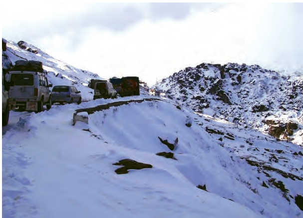
Fig. 7.4: Traffic on north-eastern border road (Arunachal Pradesh)

Roads can also be classified on the basis of the type of material used for their construction such as metalled and unmetalled roads. Metalled roads may be made of cement, concrete or even bitumen of coal, therefore, these are all weather roads. Unmetalled roads go out of use in the rainy season.