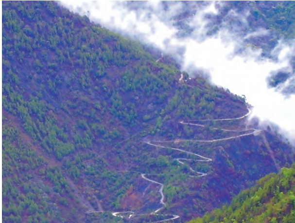
Fig. 7.3: Hilly Tracts

maintains roads in the bordering areas of the country. This organisation was established in 1960 for the development of the roads of strategic importance in the northern and north-eastern border areas. These roads have improved accessibility in areas of difficult terrain and have helped in the economic development of these area.