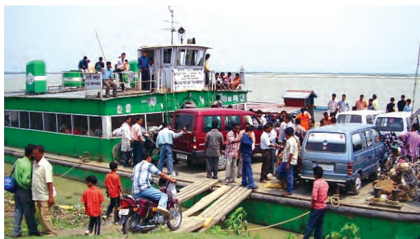
Fig. 7.5: Inland waterways widely used in north-eastern states