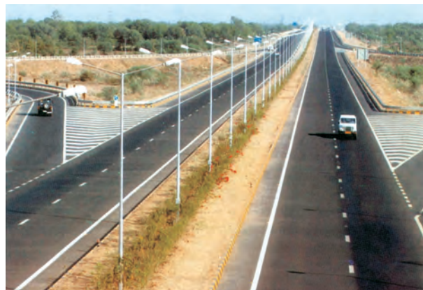
Fig.7.2: Ahmedabad-Vadodara Expressway

laid and maintained by the Central Public Works Department (CPWD). A number of major National Highways run in North-South and East-West directions. The historical Sher-Shah Suri Marg is called National Highway No.1, between Delhi and Amritsar.