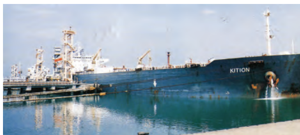
Fig. 7.7: Tanker discharging crude oil at New Mangalore port

Mumbai is the biggest port with a spacious natural and well-sheltered harbour. The Jawaharlal Nehru port was planned with a view to decongest the Mumbai port and serve as a hub port for this region. Marmagao port (Goa) is the premier iron ore exporting port of the country. This port accounts for about fifty per cent of India's iron ore export. New Mangalore port, located in Karnataka caters to the export of iron ore concentrates from Kudremukh mines. Kochchi is the extreme south-western port, located at the entrance of a lagoon with a natural harbour.