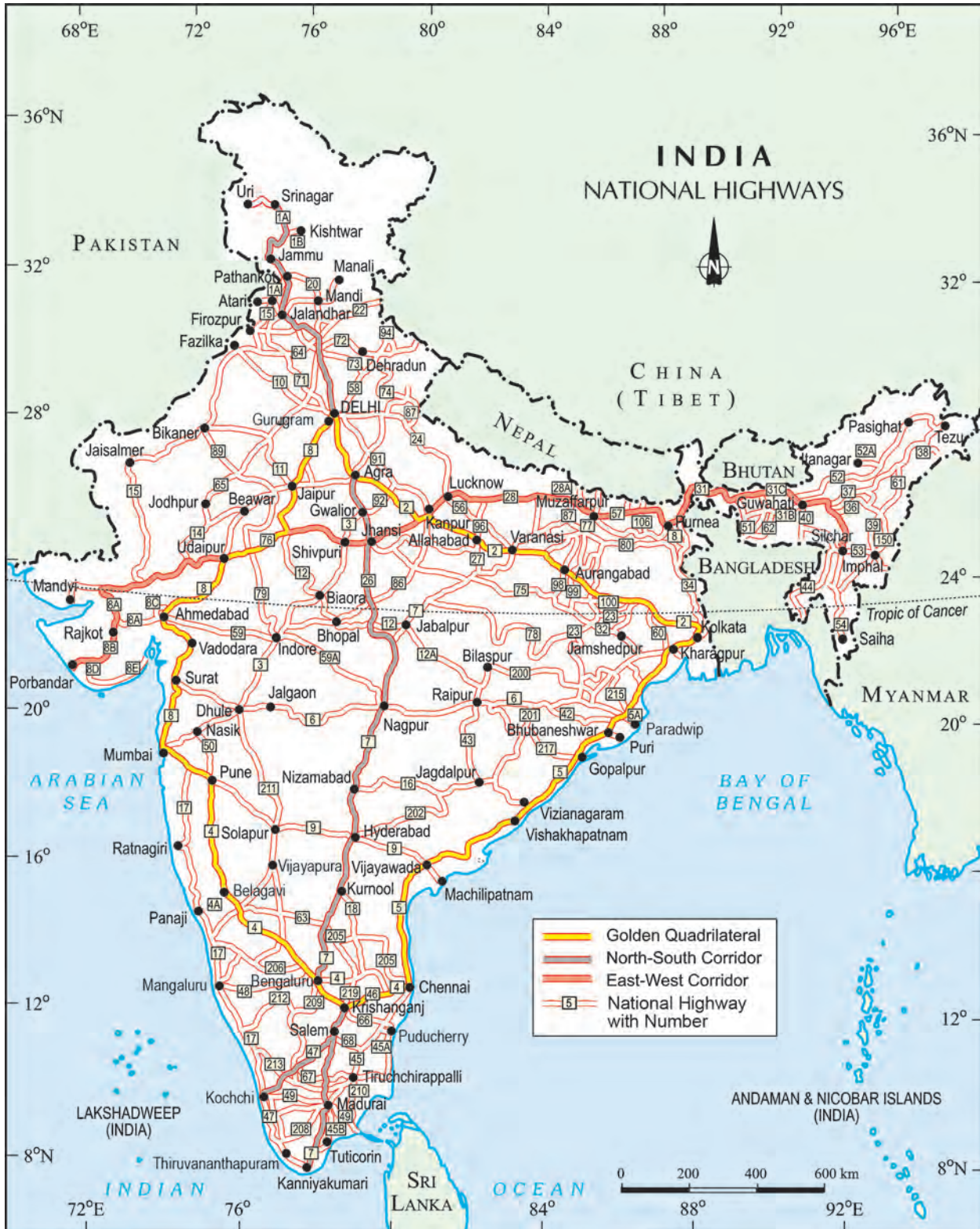
India: National Highways