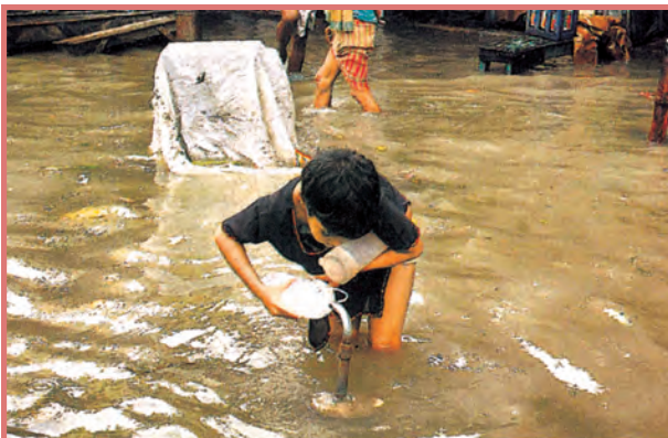
Water, Water Everywhere, Not a Drop to Drink: After a heavy downpour, a boy collects drinking water in Kolkata. Life in the city and its adjacent districts was paralysed as incessant overnight rain, meaning a record 180 mm, flooded vast area and disrupted traffic.

consequent greater demands for water, and unequal access to it. A large population requires more water not only for domestic use but also to produce more food. Hence, to facilitate higher food-grain production, water resources are being over-exploited to expand irrigated areas for dry-season agriculture. Irrigated agriculture is the largest consumer of water. Now it is needed to revolutionise the agriculture through developing drought resistant crops and dry farming techniques. You may have seen in many television advertisements that most farmers have their