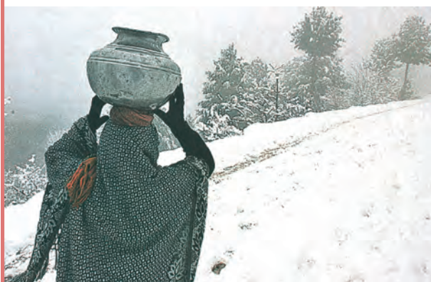
A Kashmiri earthquake survivor carries water in the snow in a devastated village.

एक ओर इजराइल जैसे 25 सेमी. औसत वार्षिक वर्षा वाले देश में जल का कोई अभाव नहीं है तो दूसरी ओर 114 सेमी. औसत वार्षिक वर्षा वाले हमारे देश में प्रति वर्ष किसी भाग में सूखा अवश्य पड़ता है। देश में जल की उपलब्धता और उसके स्वरूप के अनुसार समुचित जलप्रबंधन न होने के कारण ही वर्षा का जल नदी-नालों में तेजी से बहकर समुद्र में चला जाता है जिससे वर्षा के बाद के लगभग नौ महीने देश के लिए पानी की कमी के होते हैं। ये ही मूल कारण हैं देश में जलीय अभाव के, जिसे हम उचित प्रबंधन के द्वारा ही नियंत्रित कर सकते हैं।