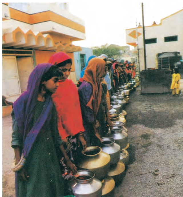
Fig. 3.1: Water Scarcity

एक ओर इजराइल जैसे 25 सेमी. औसत वार्षिक वर्षा वाले देश में जल का कोई अभाव नहीं है तो दूसरी ओर 114 सेमी. औसत वार्षिक वर्षा वाले हमारे देश में प्रति वर्ष किसी भाग में सूखा अवश्य पड़ता है। देश में जल की उपलब्धता और उसके स्वरूप के अनुसार समुचित जलप्रबंधन न होने के कारण ही वर्षा का जल नदी-नालों में तेजी से बहकर समुद्र में चला जाता है जिससे वर्षा के बाद के लगभग नौ महीने देश के लिए पानी की कमी के होते हैं। ये ही मूल कारण हैं देश में जलीय अभाव के, जिसे हम उचित प्रबंधन के द्वारा ही नियंत्रित कर सकते हैं।