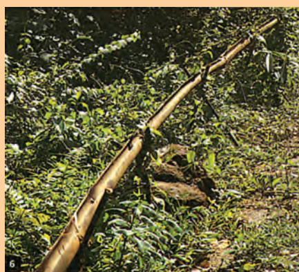
Picture 5 and 6 Reduced channel sections and diversion units are used at the last stage of water application. The last channel section enables water to be dropped near the roots of the plant.