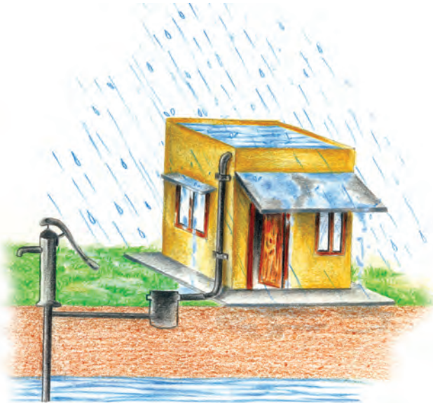
(a) Recharge through Hand Pump

irrigate their fields. In arid and semi-arid regions, agricultural fields were converted into rain fed storage structures that allowed the water to stand and moisten the soil like the 'khadins' in Jaisalmer and 'Johads' in other parts of Rajasthan.