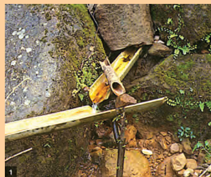
Picture 1: Bamboo pipes are used to divert perennial springs on the hilltops to the lower reaches by gravity.

In Meghalaya, a 200-year-old system of tapping stream and spring water by using bamboo pipes, is prevalent. About 18-20 litres of water enters the bamboo pipe system, gets transported over hundreds of metres, and finally reduces to 20-80 drops per minute at the site of the plant.