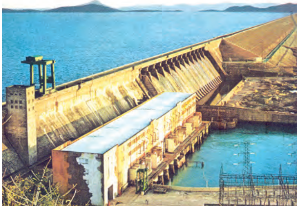
Fig. 3.2: Hirakud Dam

What are dams and how do they help us in conserving and managing water? Dams were traditionally built to impound rivers and rainwater that could be used later to irrigate agricultural fields. Today, dams are built not just for irrigation but for electricity generation, water supply for domestic and industrial uses, flood control, recreation, inland navigation and fish breeding. Hence, dams are now referred to as multi-purpose projects where the many uses of the impounded water are integrated with one another. For example, in the Sutluj-Beas river basin, the Bhakra – Nangal project water is being used both for hydel power production and irrigation. Similarly, the Hirakud project in the Mahanadi basin integrates conservation of water with flood control.