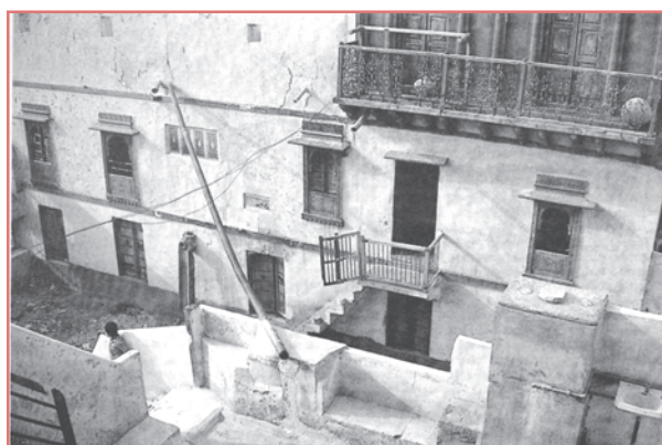
Rooftop harvesting was common across the towns and villages of the Thar. Rainwater that falls on the sloping roofs of houses is taken through a pipe into an underground tanka (circular holes in the ground), built in the main house or in the courtyard. The picture above shows water being taken from a neighbour's roof through a long pipe. Here the neighbour's rooftop has been used for collection of rainwater. The picture shows a hole through which rainwater flows down into an underground tanka .

Fortunately, in many parts of rural and urban India, rooftop rainwater harvesting is being successfully adapted to store and conserve water. In Gendathur, a remote backward village in Mysuru, Karnataka, villagers have installed, in their households rooftop, rainwater harvesting system to meet their water needs. Nearly 200 households have installed this system and the village has earned the rare distinction of being rich in rainwater. See Fig. 3.6 for a better understanding of the rooftop rainwater harvesting system which is adapted here. Gendathur receives an annual precipitation of 1,000 mm, and with 80 per cent of collection efficiency and of about 10 fillings, every house can collect and use about 50,000 litres of water annually. From the 200 houses, the net amount of rainwater harvested annually amounts to 1,00,000 litres.