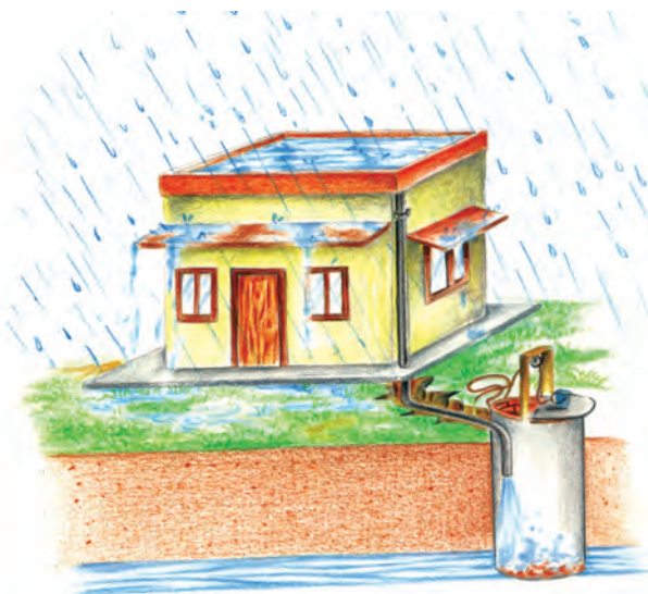
(b) Recharge through Abandoned Dugwell