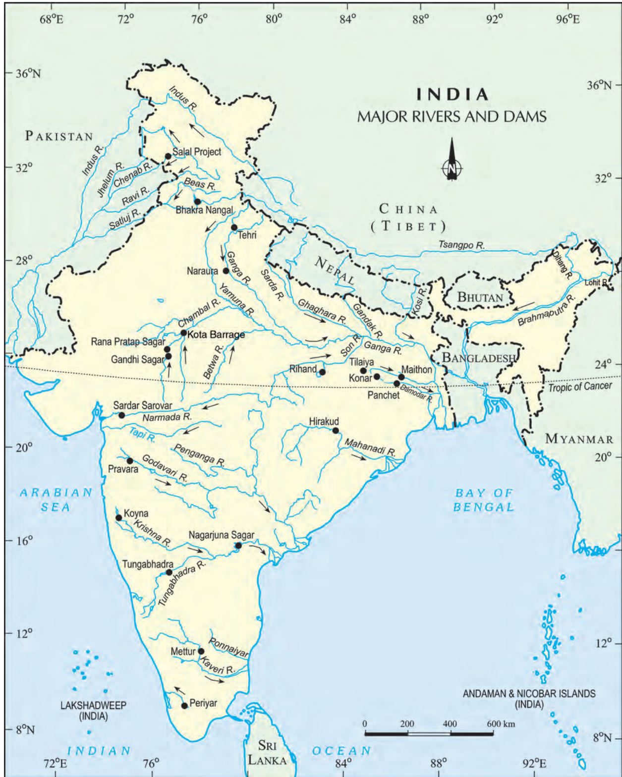
India: Major Rivers and Dams