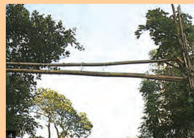
Picture 4: If the pipes pass a road, they are taken high above the land.