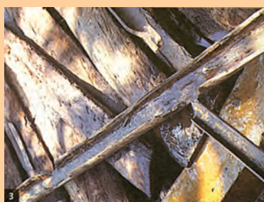
Picture 2 and 3: The channel sections, made of bamboo, divert water to the plant site where it is distributed into branches, again made and laid out with different forms of bamboo pipes. The flow of water into the pipes is controlled by manipulating the pipe positions.