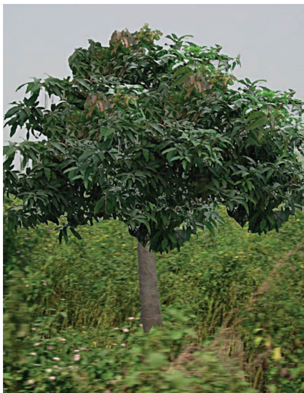
Fig. 7.3 (a) : Wild Mango

Madhavji shows sal and wild mango (Fig. 7.3 (a)) as two examples of the