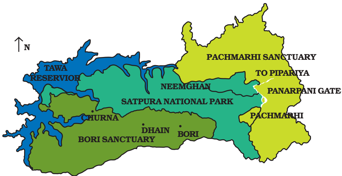
Fig. 7.1 : Pachmarhi Biosphere Reserve