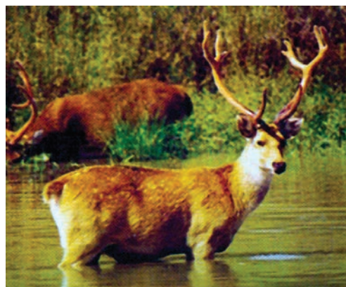
Fig. 7.6 : Barasingha

animals has become difficult because of disturbances in their natural habitat. Professor Ahmad tells them that in order to protect plants and animals strict rules are imposed in all National Parks. Human activities such as grazing, poaching, hunting, capturing of animals or collection of firewood, medicinal plants, etc. are not allowed