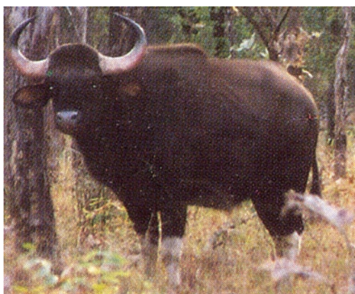
Fig. 7.5 : Wild buffalo

buffaloes (Fig. 7.5) and barasingha (Fig. 7.6) were also found in the Satpura National Park. Animals whose numbers are diminishing to a level that they might face extinction are known as the endangered animals . Boojho is reminded of the dinosaurs which became extinct a long time ago. Survival of some