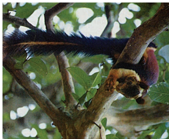
Fig. 7.3 (b) : Giant squirrel

endemic flora of the Pachmarhi Biosphere Reserve. Bison, Indian giant squirrel [Fig. 7.3 (b)] and flying squirrel are endemic fauna of this area. Professor Ahmad explains that the destruction of their habitat, increasing population and introduction of new species may affect the natural habitat of endemic species and endanger their existence.