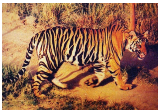
Fig. 7.4 : Tiger

Tiger (Fig. 7.4) is one of the many species which are slowly disappearing from our forests. But, the Satpura Tiger Reserve is unique in the sense that a significant increase in the population of tigers has been seen here. Once upon a time, animals like lions, elephants, wild