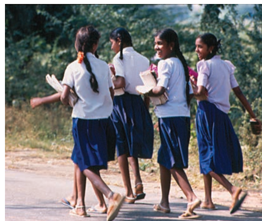
Why do girls like to go to school together in groups?

In what ways do the experiences of Samoan children and teenagers differ from your own experiences of growing up? Is there anything in this experience that you wish was part of your growing up?