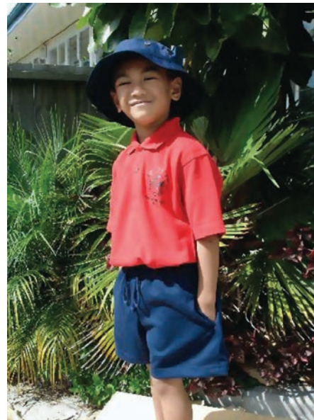
A Class VII Samoan child in his school uniform.

From Class VI onwards, boys and girls went to separate schools. The girls' school was designed very differently from the boys' school. They had a central courtyard where they played in total seclusion and