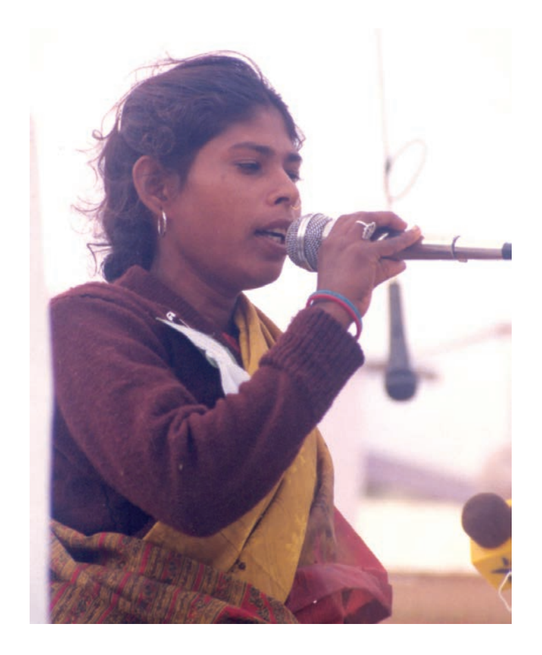
Over 1,500 persons attended a public hearing in Lucknow in 2001 to protest violence against women. Over 15 cases of violence against women were heard by a jury of eminent women who played the role of judges. This people's jury helped highlight the lack of support in the legal system for women who seek justice in such cases.

Issues of equality are central to a democracy. In this book, we have tried to highlight issues that pose a challenge to this idea of equality in a democracy. These, as you have read, include the privatisation of health services in the country, the increasing control that business houses exert on the media, the low value given to women and their work, and the low earnings made by small farmers who grow cotton. These issues substantially affect poor and marginalised communities, and therefore, concern economic and social equality in the country.