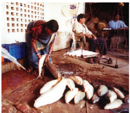
Top: Members of the TMS protesting at a rally. Above: A member of the cooperative weighing the fish.

With the TMS taking over the fishworkers were able to increase their earnings substantially. This was because they set up the cooperative which would buy the catch from them at a fair price. The cooperative would then arrange to transport and sell this in markets where they would get a good price. They have now begun to earn three times more than they earned earlier. The TMS has also begun giving the fishworkers loans for repair and the buying of new nets. By managing to earn a higher wage as well as preserving the fish in the reservoir, the TMS has shown that when people's organisations get their rights to livelihood, they can be good managers.