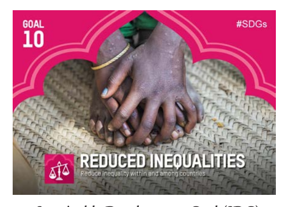
Sustainable Development Goal (SDG) www.in.undp.org

Often, some of these persons become more widely recognised because they have the support or represent large numbers of people who have united to address a particular issue of inequality. In India, there are several struggles in which people have come together to fight for issues that they believe are important. In Chapter 5, you read about the methods used by the women's movement to raise issues of equality. The Tawa Matsya Sangh in Madhya Pradesh is another example of people coming together to fight for an issue. There are many such struggles such as those among beedi workers, fisherfolk, agricultural