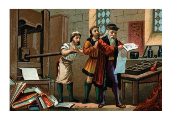
An artist's impression of Gutenberg printing the first sheet of the Bible.

Changing technology, or machines, and making technology more modern, helps media to reach more people. It also improves the quality of sound and the images that you see. But technology does more than this. It also changes the ways in which we think about our lives. For example, today it is quite difficult for us to think of our lives without television. Television has enabled us to think of ourselves as members of a larger global world. Television images travel huge