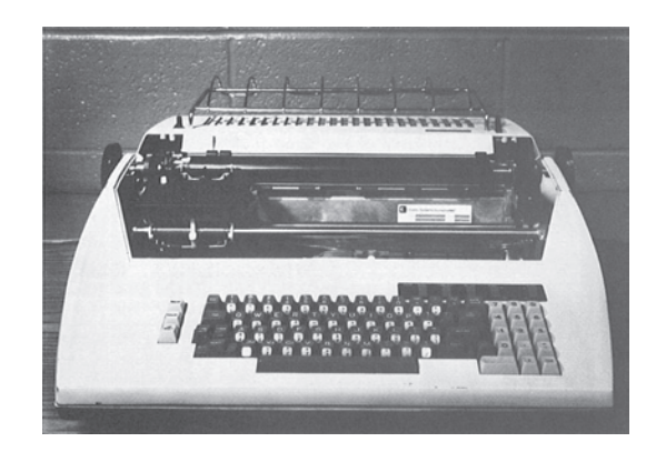
With electronic typerwriters, journalism underwent a sea-change in the 1940s.