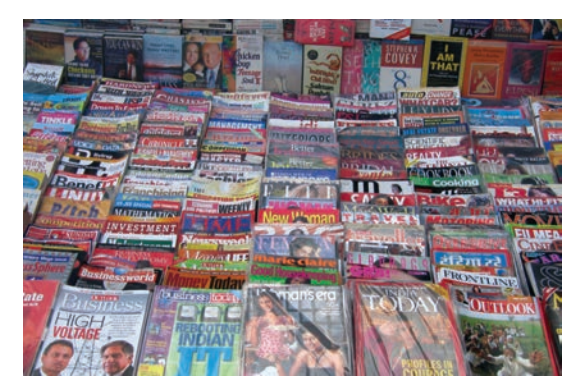
The print media offers a large variety of information to suit the tastes of different readers.