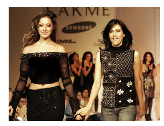
Fashion shows are very popular with the media.

As citizens of a democracy, the media has a very important role to play in our lives because it is through the media that we hear about issues related