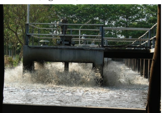
Fig. 18.6 Aerator

4. Air is pumped into the clarified water to help aerobic bacteria to grow. Bacteria consume human waste, food waste, soaps and other unwanted matter still remaining in clarified water (Fig. 18.6).