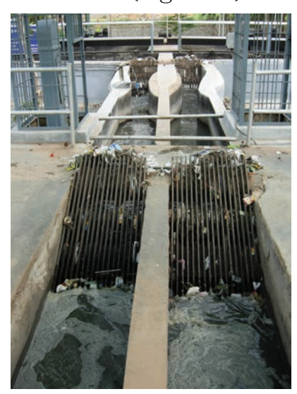
Fig. 18.3 Bar screen

1. Wastewater is passed through bar screens. Large objects like rags, sticks, cans, plastic packets, napkins are removed (Fig. 18.3).