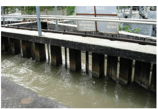
Fig. 18.4 Grit and sand removal tank

2. Water then goes to a grit and sand removal tank. The speed of the incoming wastewater is decreased to allow sand, grit and pebbles to settle down (Fig. 18.4).