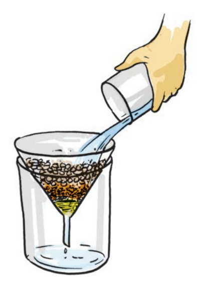
Fig. 18.2 Filtration process