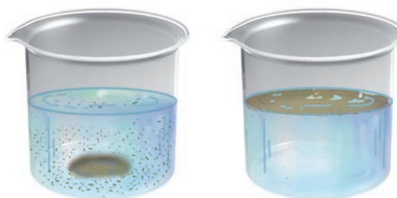
Fig. 4.4 What disappears, what doesn't?

beakers. Fill each one of them about two-thirds with water. Add a small amount (spoonful) of sugar to the first glass, salt to the second and similarly, add small amounts of the other substances into the other glasses. Stir the contents of each of them with a spoon. Wait for a few minutes. Observe what happens to the substances added to water (Fig. 4.4). Note your observations as shown in Table 4.3.