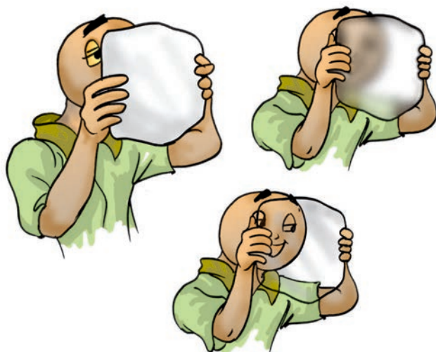
Fig. 4.7 Looking through opaque, transparent or translucent material

You might have played the game of hide and seek. Think of some places where you would like to hide so that you are not seen by others. Why did you choose those places? Would you have tried to