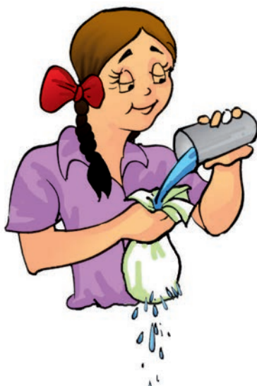
Fig. 4.2 Using a cloth tumbler

Have you ever wondered why a tumbler is not made with a piece of cloth? Recall our experiments with pieces of cloth in Chapter 3 and also keep in mind that we generally use a tumbler to keep a liquid. Therefore, would it not be silly, if we were to make a tumbler out of cloth (Fig 4.2)! What we need for a tumbler is glass, plastics, metal or other such material that will hold water. Similarly, it would not be wise to use paper-like materials for cooking vessels.