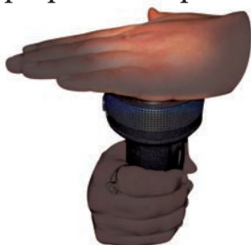
Fig. 4.9 Does torch light pass through your palm?

We can therefore group materials as opaque, transparent and translucent.