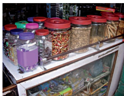
Fig. 4.8 Transparent bottles in a shop

hide behind a glass window? Obviously not, as your friends can see through that and spot you. Can you see through all the materials? Those substances or materials, through which things can be seen, are called transparent (Fig. 4.7). Glass, water, air and some plastics are examples of transparent materials. Shopkeepers usually prefer to keep biscuits, sweets and other eatables in transparent containers of glass or