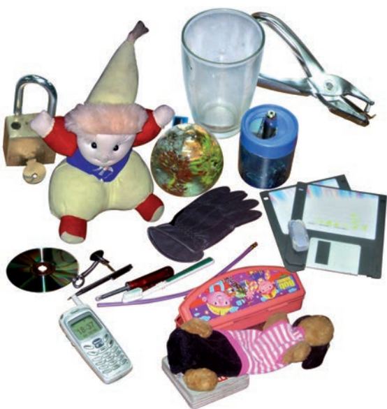
Fig. 4.1 Objects around us

Let us collect as many objects as possible, from around us. Each of us could get some everyday objects from home and we could also collect some objects from the classroom or from outside the school. What will we have in our collection? Chalk, pencil, notebook, rubber, duster, a hammer, nail, soap, spoke of a wheel, bat,