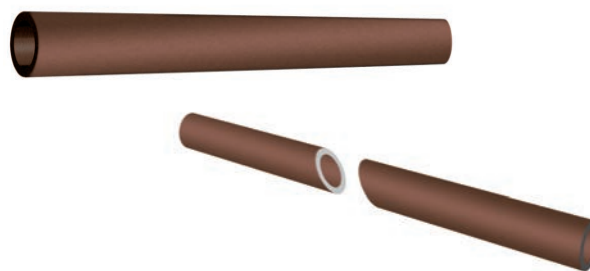
Fig. 4.3 Cutting pieces of materials to see if they have lustre

Do you notice such a shine or lustre in the other materials, cut them anyway as you can? Repeat this in the class with as many materials as possible and make a list of those with and without lustre. Instead of cutting, you can rub the surface of material with sand paper to see if it has lustre.