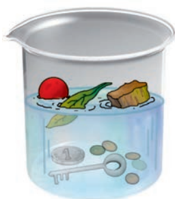
Figure 4.6 Some objects float in water while others sink in it

drops of honey that you let fall into a glass of water. What happens to all of these?