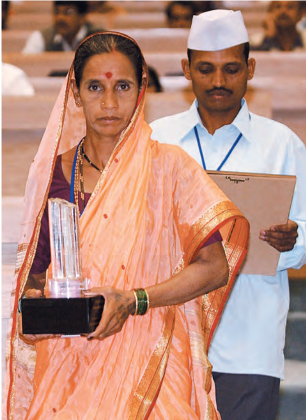
Two village Panchs from Maharashtra who were awarded the Nirmal Gram Puruskar in 2005 for the excellent work done by them in the Panchayat.

In some states, Gram Sabhas form committees like construction and development committees. These committees include some members of the Gram Sabha and some from the Gram Panchayat who work together to carry out specific tasks.