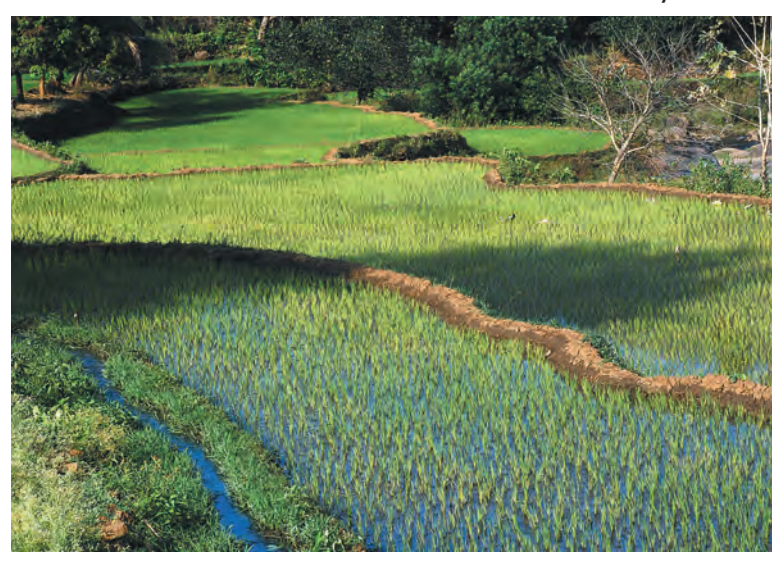
Transplanted paddy growing in a few of Ramalingam's 20 acres. A result of hard labour performed by agricultural workers like Thulasi.