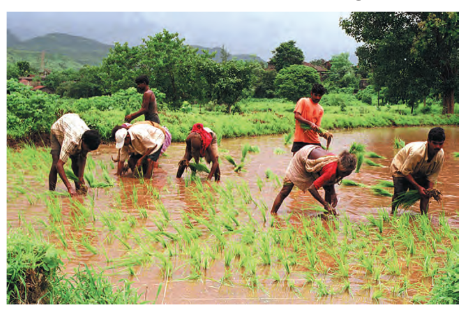
Transplanting paddy is back-breaking work.

The village is surrounded by low hills. Paddy is the main crop that is grown in irrigated lands. Most of the families earn a living through agriculture.