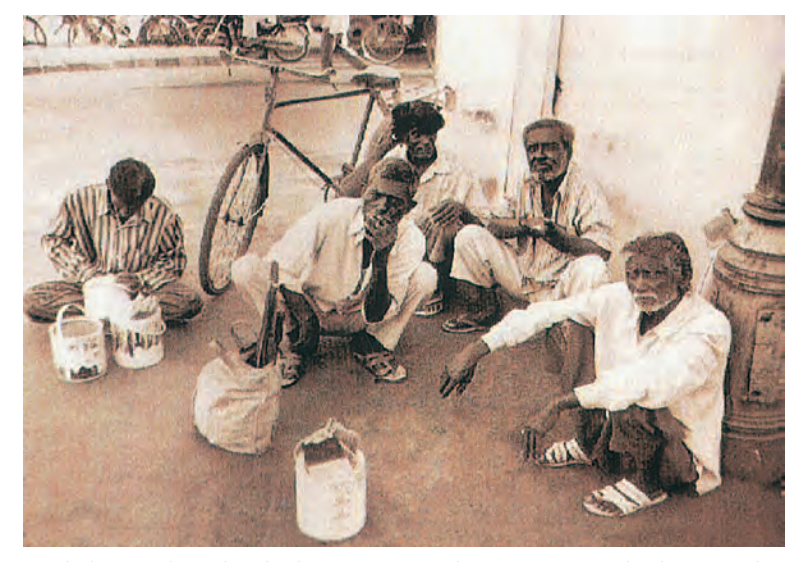
At labour chowk, daily wage workers wait with their tools for people to come and take them for work.

trucks in the market, dig pipelines and telephone cables and also build roads. There are thousands of such casual workers in the city.