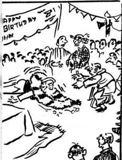
I told him to make the garland smaller... He is a frail old man and wouldn't be able to stand the weight of such a huge garland!