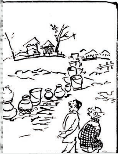
Not bad! One of the taps in the nearby village must be getting water!