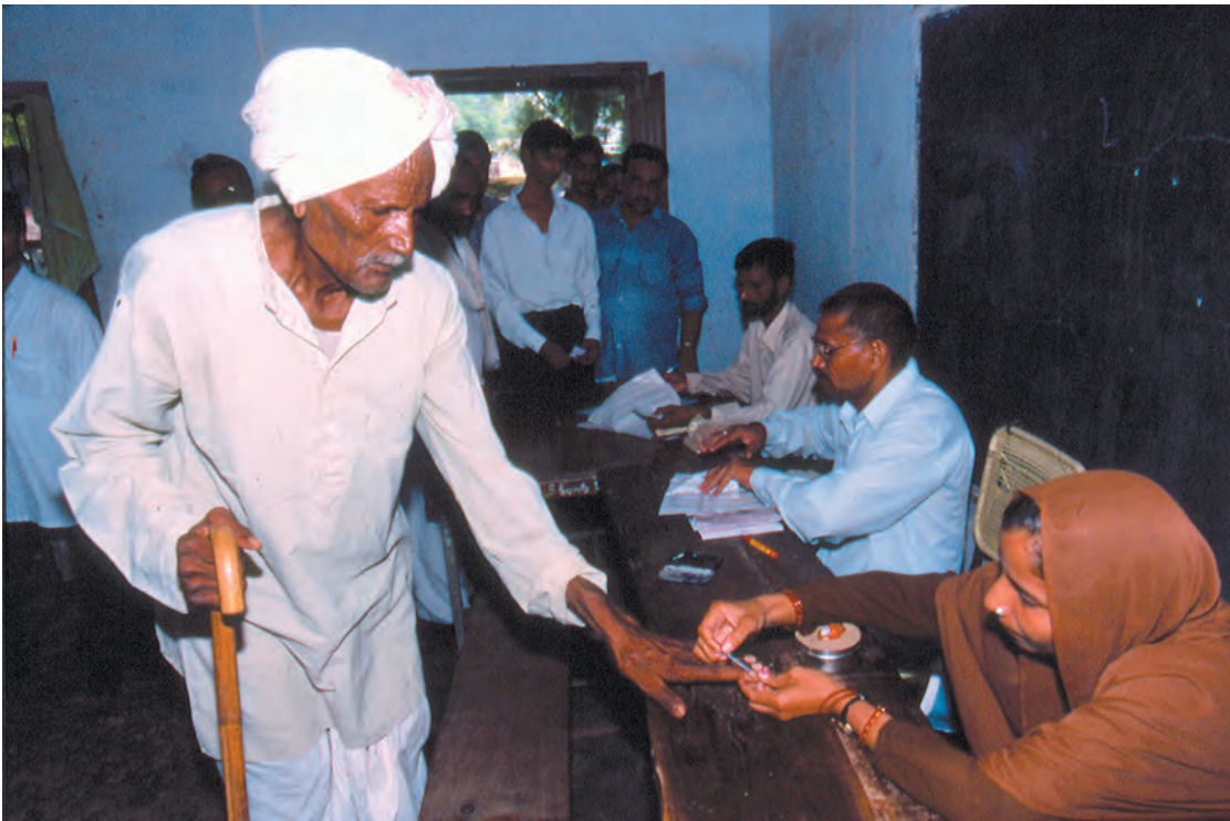
Voting in a rural area: A mark is put on the finger to make sure that a person casts only one vote.

decisions for the entire population. These days a government cannot call itself democratic unless it allows what is known as universal adult franchise. This means that all adults in the country are allowed to vote.